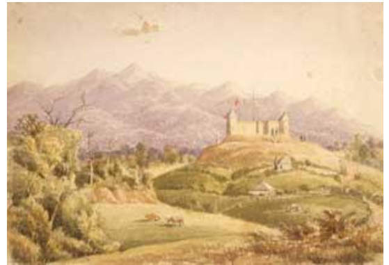
Omata Stockade – Battle of Waireka

One hundred and fifty years ago, war erupted in Taranaki. It raged across Taranaki for 21 years, and its legacy lives on today. The first shots were fired at Waitara on 17 March 1860. It was the events at Waitara that the following saying was coined and remains with Taranaki Whaanui today "Ko Waitara, Ko Waitara, ko te raa teenei i mate ai te whenua, i mate ai te tangata" (Waitara, Waitara, the day the land and people were destroyed). Taranaki Iwi were involved in events leading to the Taranaki war of 1860. Taranaki rangatira such as Te Matakatea were involved in the siege of Te Karaka Pa and led fighting men of Taranaki to Kaipopo pa, Waireka, where they were involved in the battle of 28 March 1860, known as the 'Battle of Waireka'. This was the first of many incidents that saw settler houses and Māori farms and villages attacked and destroyed. Since the First Taranaki War, Taranaki Iwi occupied disputed land at Ōmata and Tataraimaka.