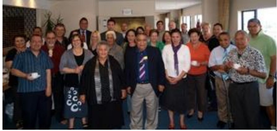
Attendees at the Christchurch Mandate Hui