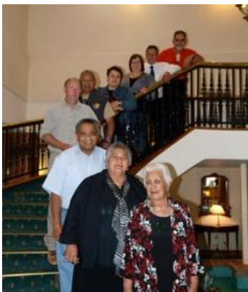
Trustees and Kaumatua

In December 2009 the Taranaki Iwi Trust submitted a Deed of Mandate to negotiate a proposed settlement package on behalf of Ngaa Uri o Taranaki Iwi. Following a submissions process and a separate assessment by Te Puni Kōkiri and the Office of Treaty Settlements, the Taranaki iwi Trust's mandate was recognised by letter from the Minister of Treaty of Waitangi Settlement Negotiations Hon Christopher Finlayson and the Minister of Māori Affairs Dr Pita Sharples on 26 February 2010. Terms of Negotiation are currently being worked through between the Claims Leadership Team and the Crown and it is envisaged that the Terms will be agreed between the two parties and signed at Te Puniho Pa, on 17 March 2010.